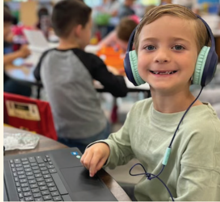
The GPFPE awarded Kerby kindergarteners new technology to replace the current outdated devices in their classrooms. Chromebooks help these kindergarten students work with equipment that is not only dependable, but has become mandatory in the district. And they are fun!